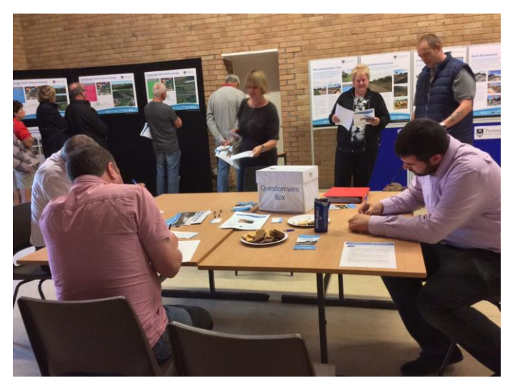
Photo 4: Visitors filling in feedback form and viewing exhibition information