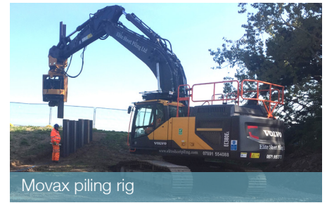
Movax piling rig