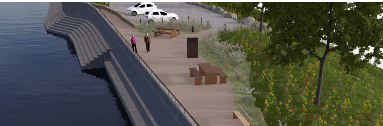
Eastern Road social spot visualisation

We would like to take the opportunity to thank you again for your support with the project in 2021, and wish you a very Happy New Year 2022.